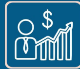
Stock Trader & Brokers