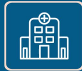
Hospitality & Health Care