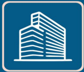
Builder & Govt. Contractor