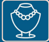
Real & imitation Jewellery