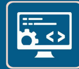
Software & I.T.